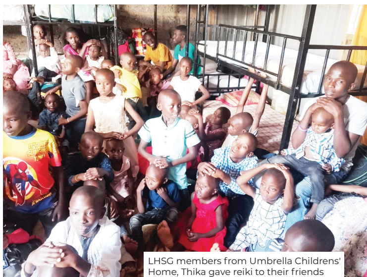
LHSG members from Umbrella Childrens' Home, Thika gave reiki to their friends