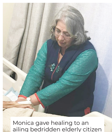
Monica gave healing to an ailing bedridden elderly citizen